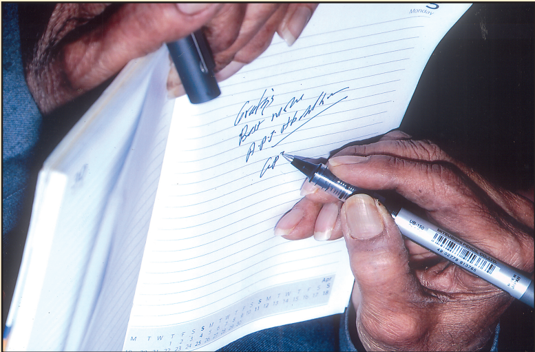
Kalam's Signature indelibly imprinted