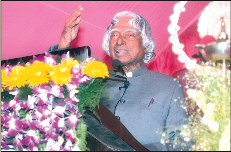
Kalam's Motto. 'I will Fly'